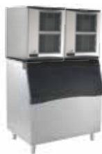
F1222 side by side on B948S