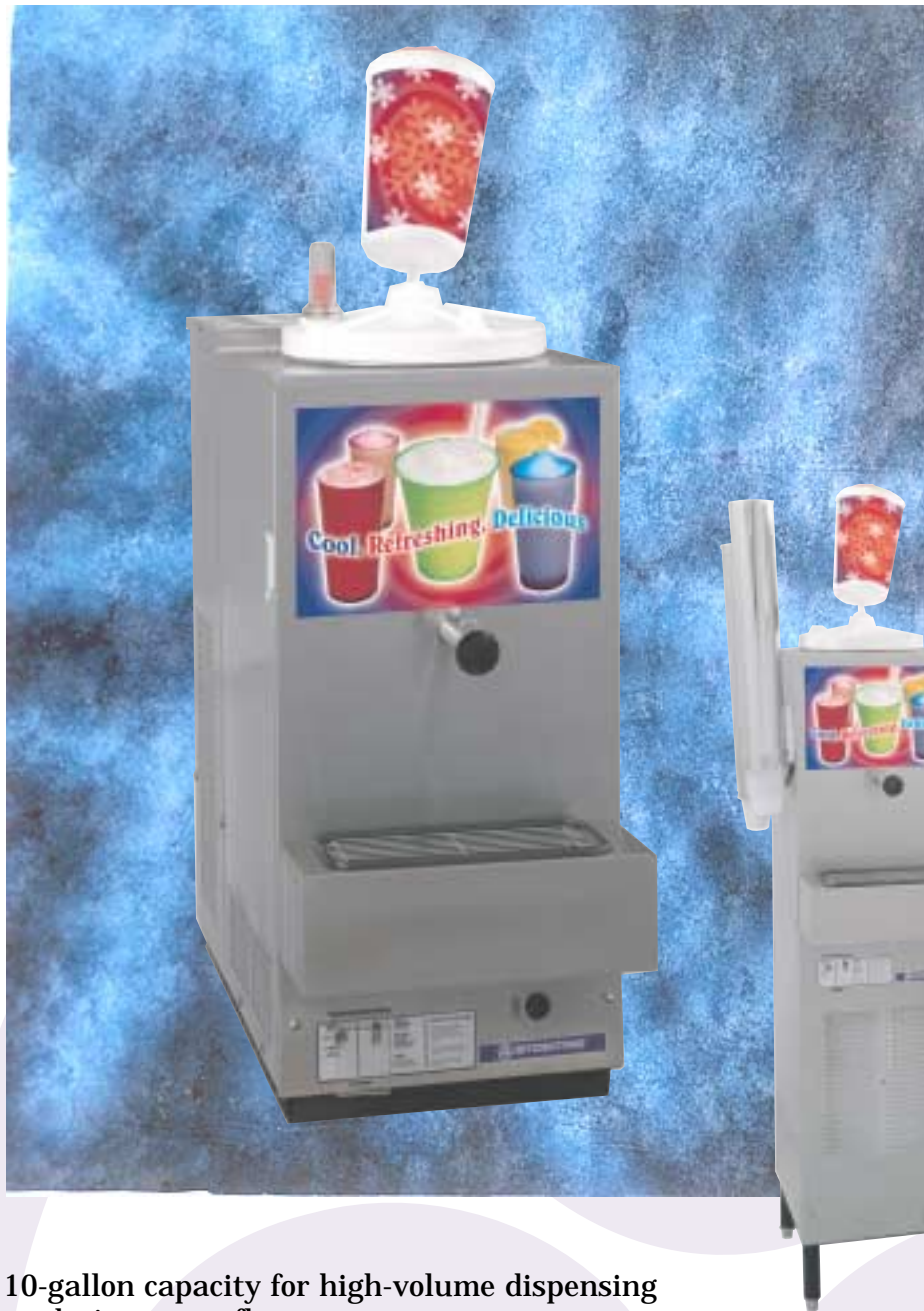
LE257 Floor Model depicting optional cup holders